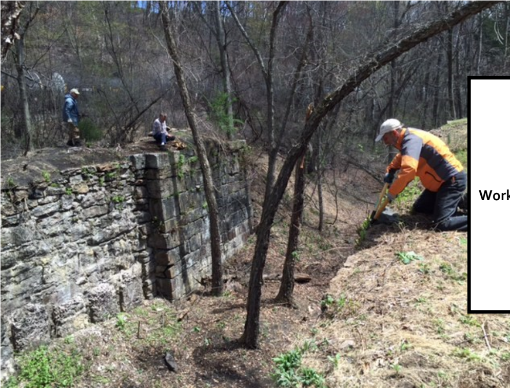
Work Crew at Lock #1

On April 23, 2016, a group of 8-10 AHC members gathered for the semi-annual maintenance and clean-up of Locks #1 and #2 on the Delaware and Lehigh National Heritage Corridor near Jim Thorpe, PA. The locks, dating from 1829, are part of the former D&L Canal which serviced the early industrial age in Pennsylvania. Neglected and overgrown for decades, these structures have been restored to museum-quality beauty after having been adopted by the Allentown Hiking Club. Photos from this recent work party are shown below.