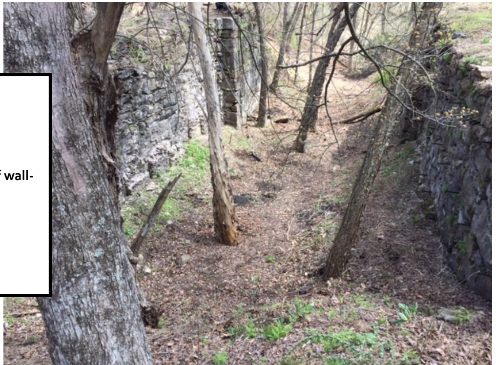
Lock #1 after cleared of wall-to-wall saplings!