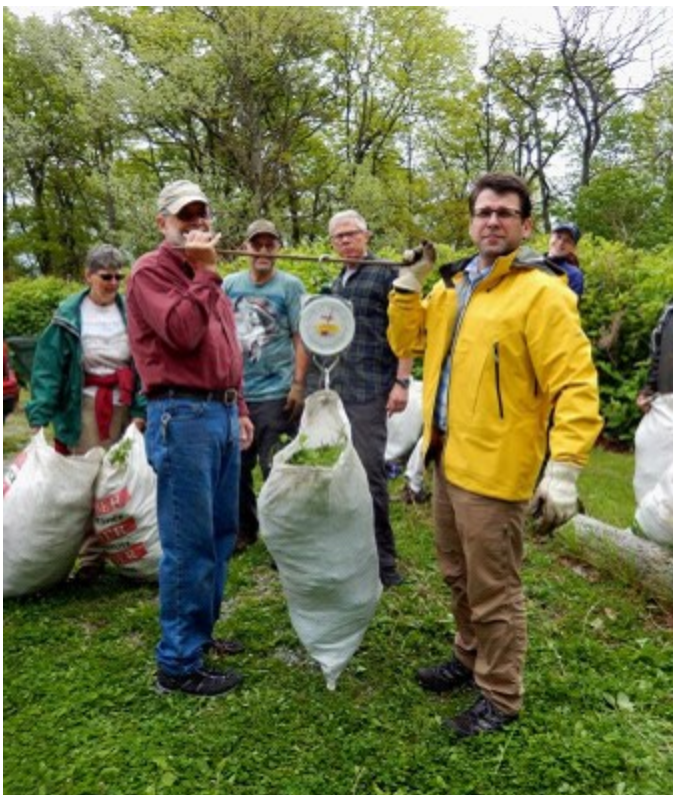
Weighting bags of garlic mustard

On Sunday, May 22, about 20 AHC members gathered at the Rt. 309 crossing of the Appalachian Trail for our annual maintenance hike. As usual, we were prepared with gloves, trash bags, loppers, clippers, and lots of energy to tackle the cleanup of the trail. This year we broke into several groups, some making improvements to the treadway (repairing the steps and clearing forest debris near the Rt. 309 crossing), some wielding paint and brushes to rejuvenate faded blazes, and some of us attacking the jungle of garlic mustard that has invaded our section of the trail.