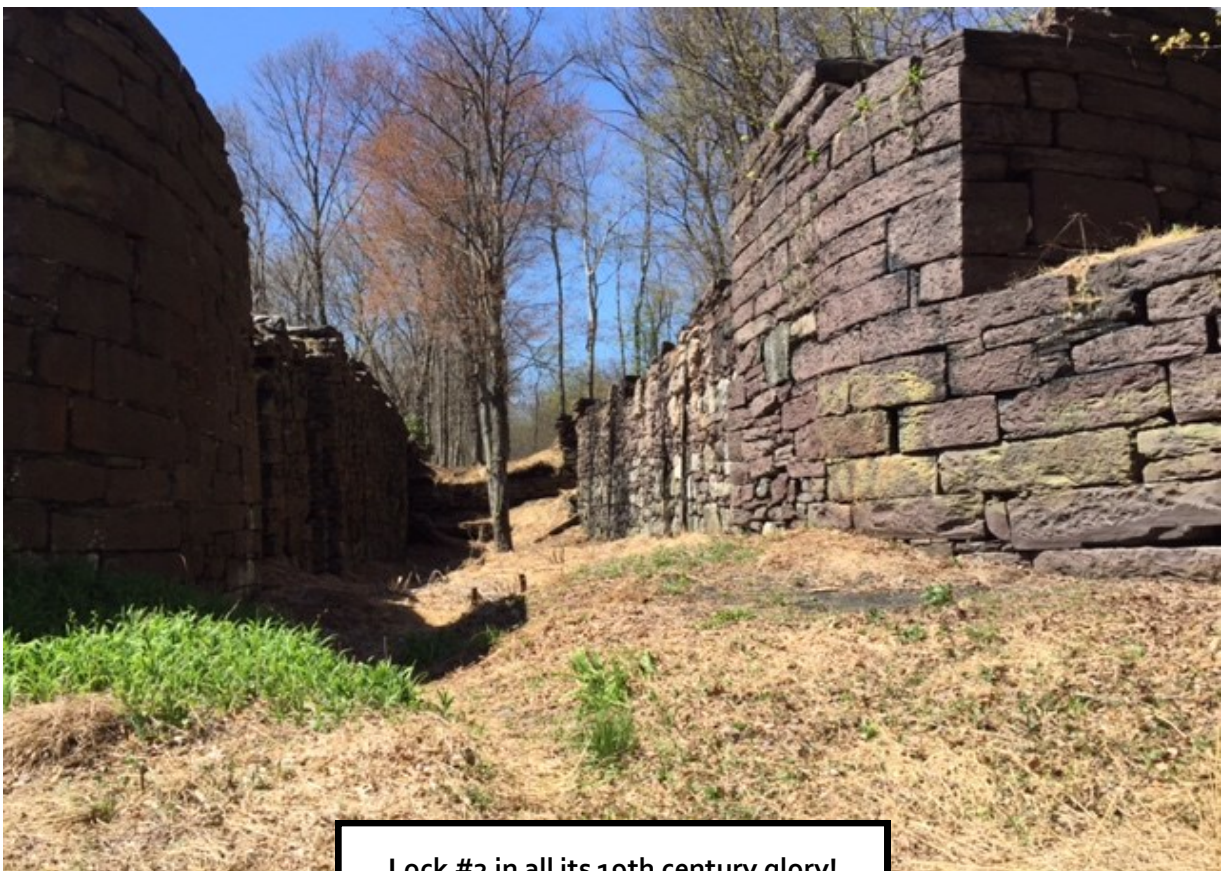
Lock #2 in all its 19th century glory!